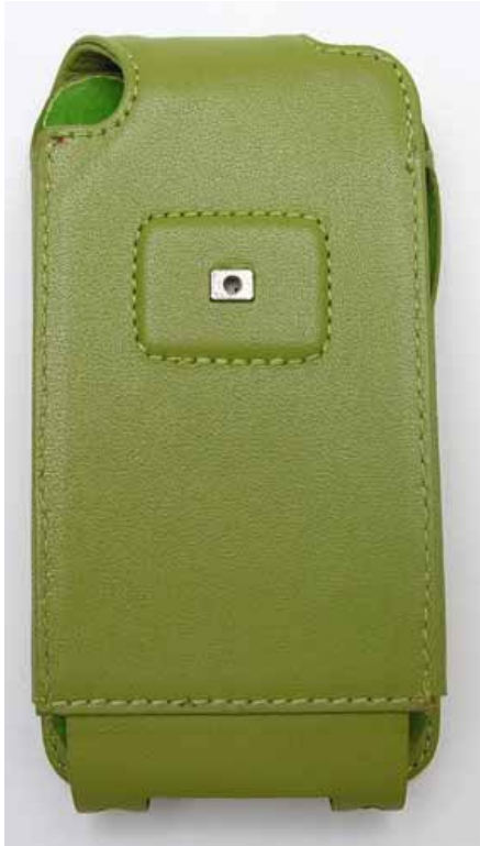
This case comes in twelve colors which include Black, Tan, Black/Blue, Black/Red, Blue, Red, Baby Blue, Green, Orange, Brown, White and Pink.